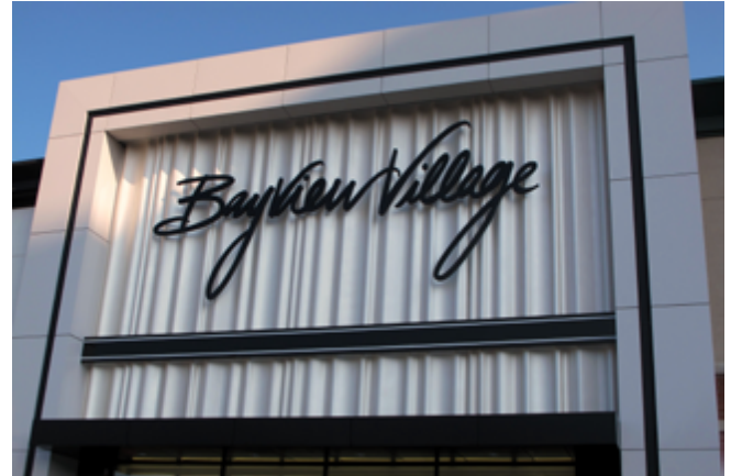
PRE-FINISHED CORRUGATED SIGN BACKER

Formglas Products Ltd. 2 Champagne Drive, Suite 200 Toronto, Ontario, Canada M3J 2C5 T: 1.866.635.8030 F: 416.635.6588 Web: formglas.com Email: info@formglas.com