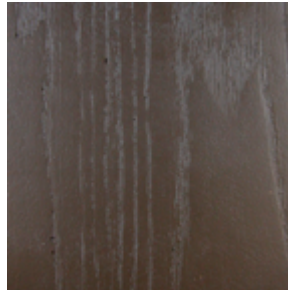
Formglas FRP Finish: Dark Brown Surface: Oak Grain Sample Size: 3" x 3" Sample Code: 98123