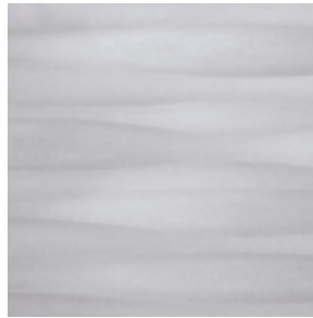
Formglas FRP Finish: Sky Grey - Paint Ready Surface: Wave Sample Size: 4" x 5" Sample Code: 98130