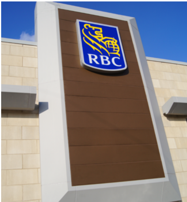
WOOD GRAIN SLATS, PROFILED SIGN FRAME