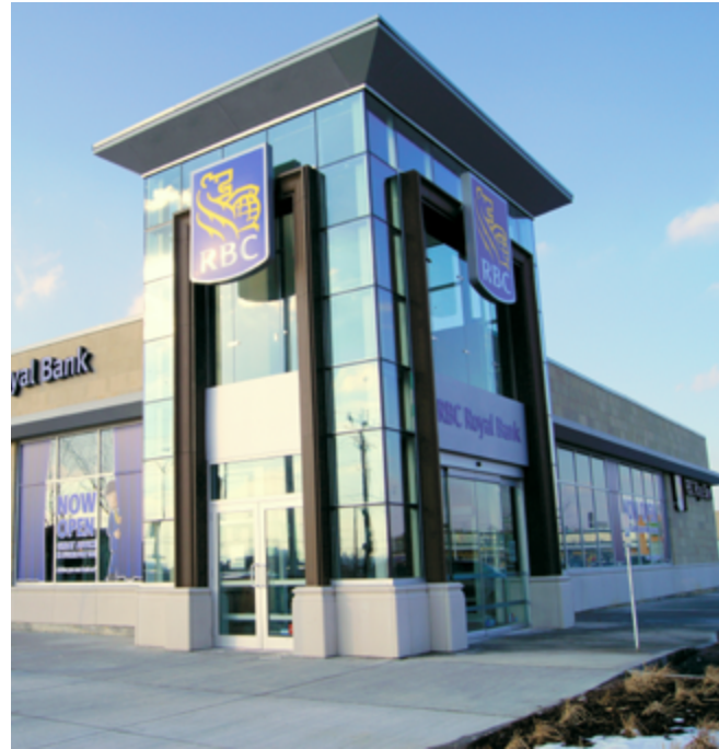
CORNICES & PORTAL ENTRY

To view photos of Formglas FRP applications, or to contact a local Formglas representative, visit www.formglas.com .